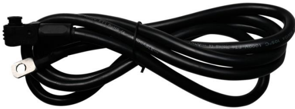
Negative battery power cable