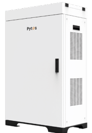
Forest RB Plus hold up 6*E-BOX 48100R