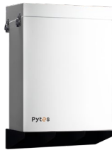
R-BOX-IP64 hold up 2*E-BOX 48100R