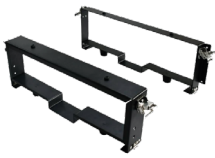
48100R Bracket hold up 1*E-BOX 48100R