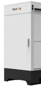
R-BOX-OC(IV) hold up 4*E-BOX 48100R